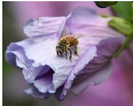
Kimberly Yates Snacktime